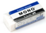
Tombow MONO eraser or other kind of eraser.