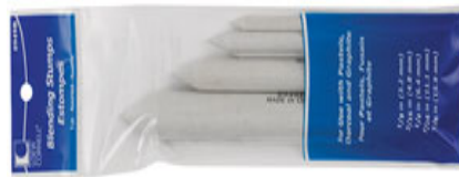
Blending Stump (Different sizes, don't get tortillons.)