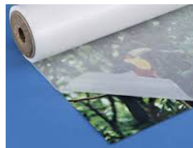
Glassine Paper (For protection. Optional)